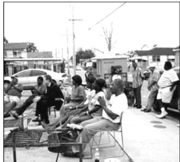
Members of the Church of All Souls in the lower Ninth Ward, New Orleans, sit on the sidewalk or lean on cars as the priest preaches from a garage, since the congregation has no church building yet.